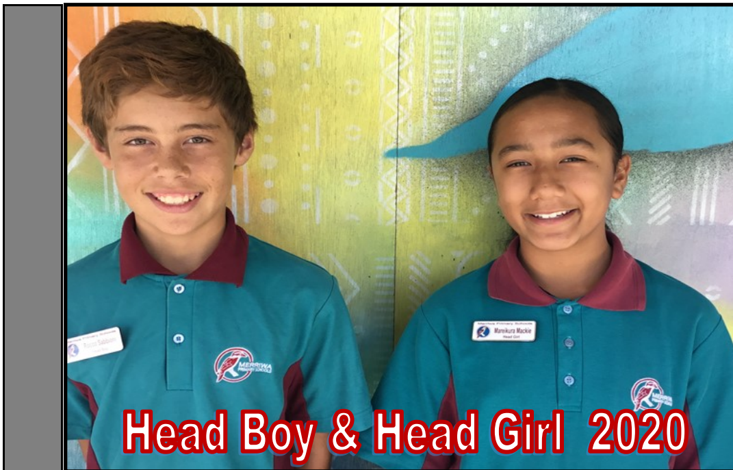
Head Boy & Head Girl 2020