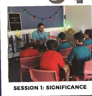
SESSION 1: SIGNIFICANCE