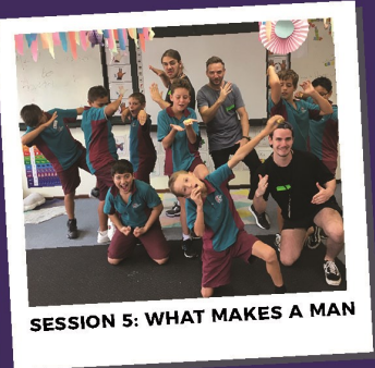
SESSION 5: WHAT MAKES A MAN