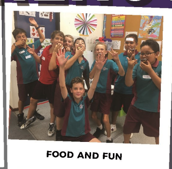
FOOD AND FUN