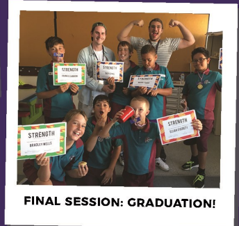
FINAL SESSION: GRADUATION!