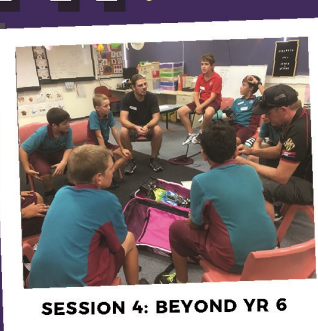
SESSION 4: BEYOND YR 6