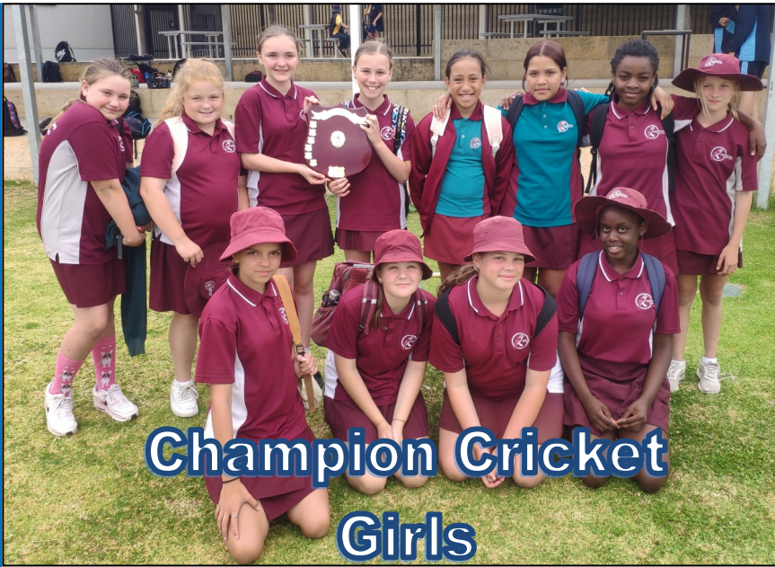
Champion Cricket Girls