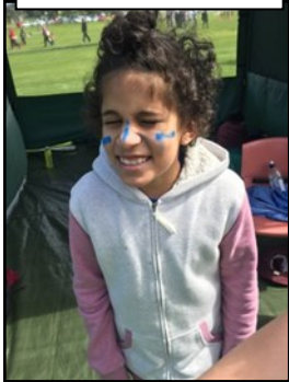
The students enjoyed the Sports Day!