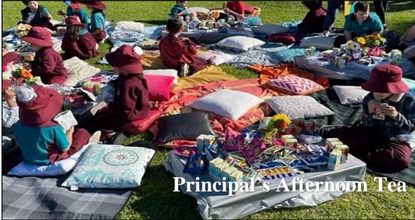
Principal's Afternoon Tea