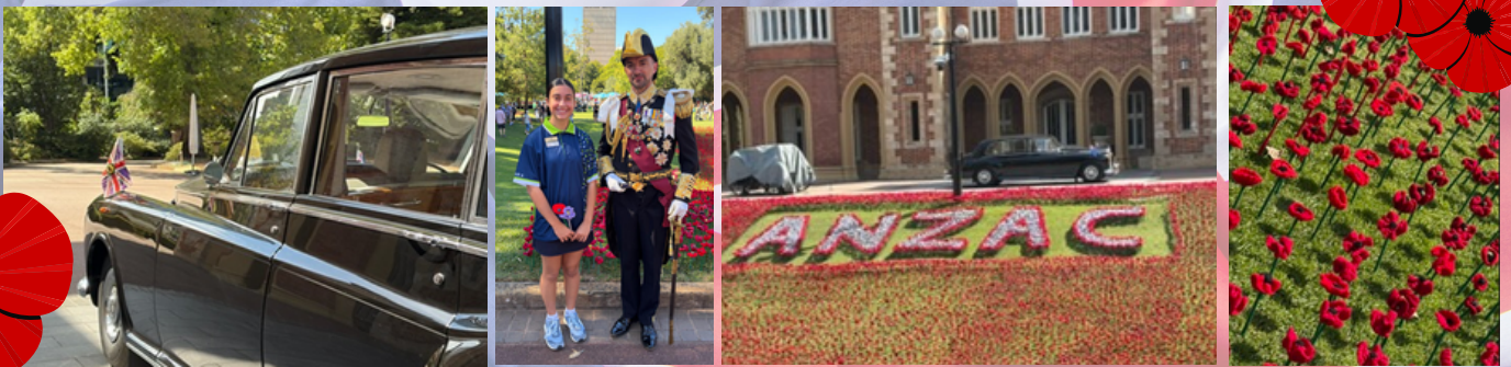
Foto dzeani siwo le ete la nye esiwo Afeno Waterhouse de le Dzidudu fe afeme na ANZAC fe N̄keke si Wouu di.